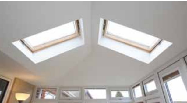
Retain natural light with roof windows

Premium quality roof windows with a choice of features are available – just ask your installer for more information.