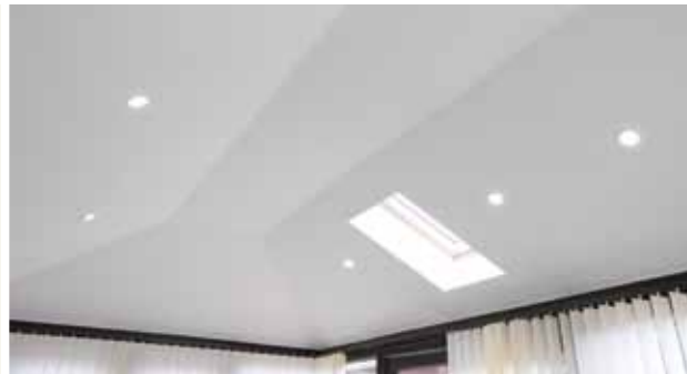
A modern, plastered finish