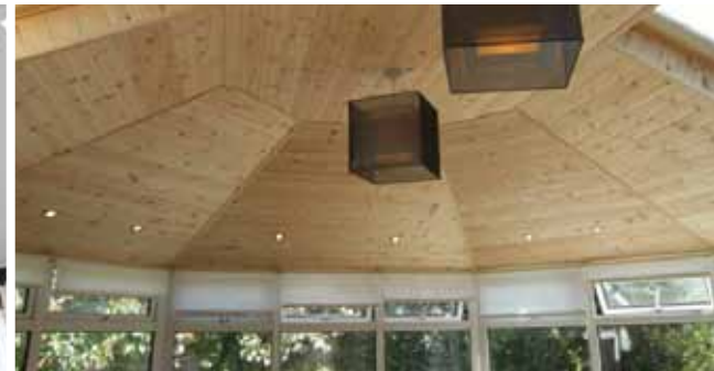
Traditional tongue-and-groove panelling