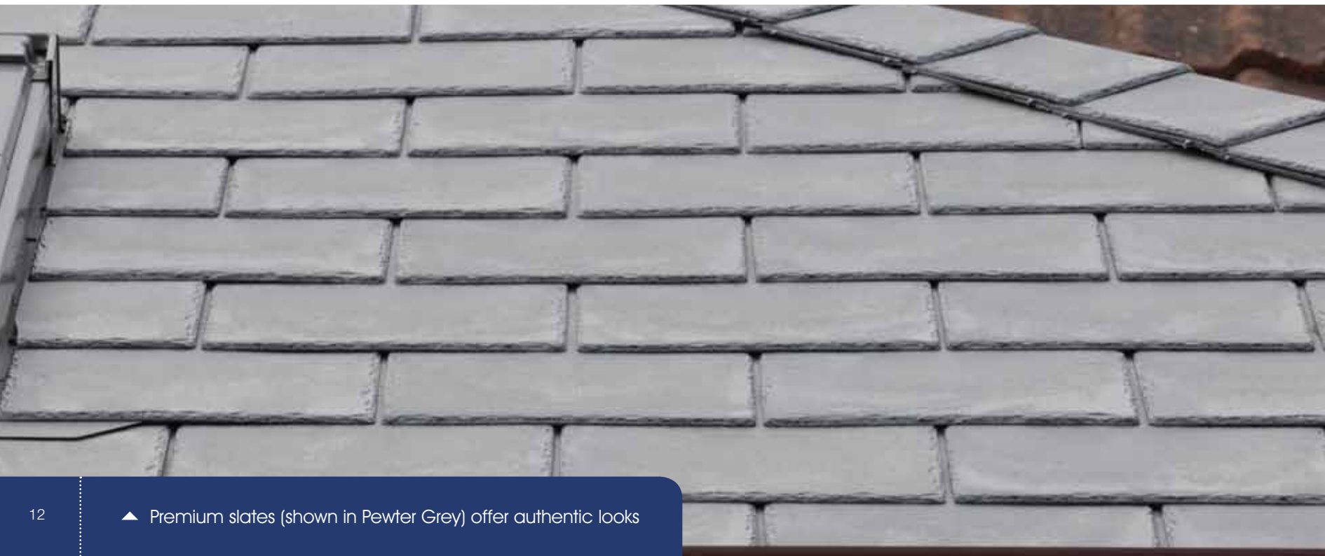
▲ Premium slates (shown in Pewter Grey) offer authentic looks