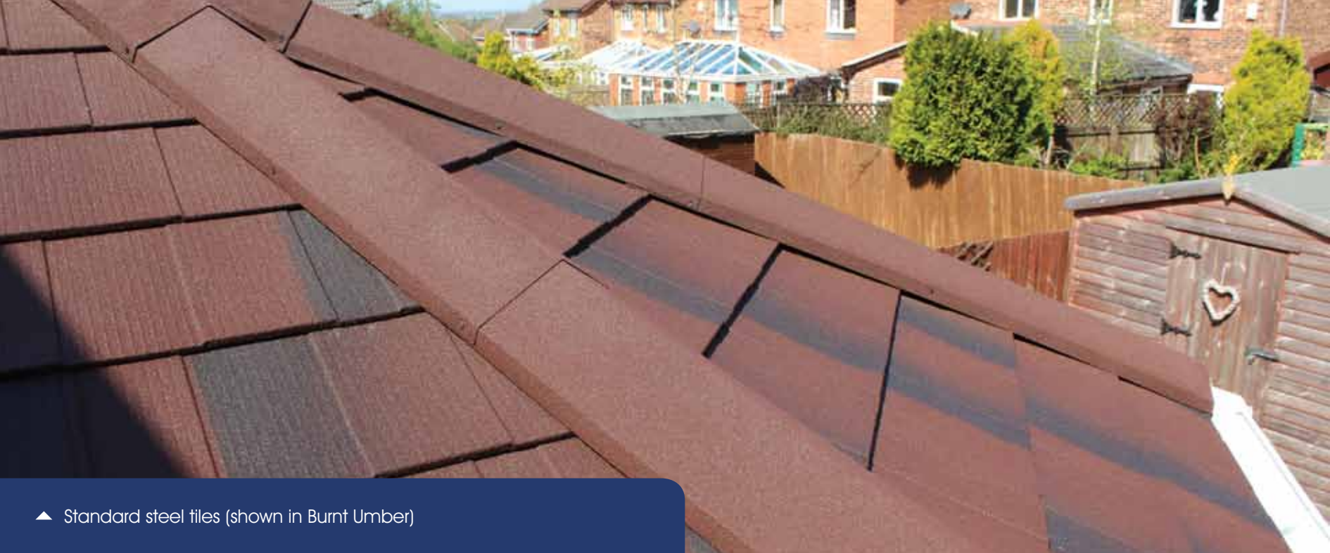
▲ Standard steel tiles (shown in Burnt Umber)